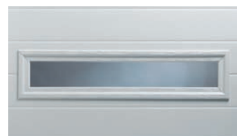
24" X 4" PLEXIGLAS