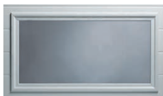
24" X 12" SSB OR INSULATED GLASS