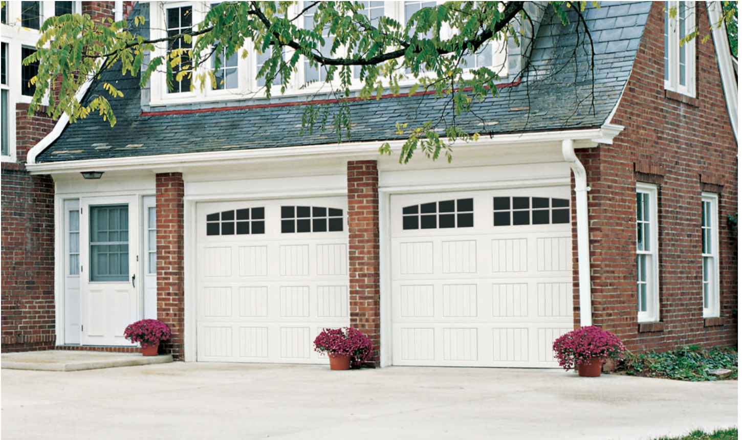
Model 9600 Sonoma shown with Arched Stockton window inserts