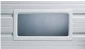
*24" X 12" SINGLE PLEXIGLAS® *24" X 12" INSULATED PLEXIGLAS®

*Note: Both options available with either a black or white frame.