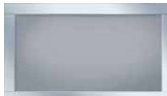
OPTIONAL FULL-VIEW PANEL

Models 2000 and 2400 feature smooth ribbed faces, while Model 2500 has a woodgrain embossed face with ribs. Model 2400 available in brown with woodgrain embossment.