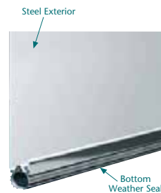
Available in 2000/2400/2500