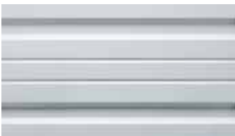
RIBBED PANEL (2000/2400 SHOWN)