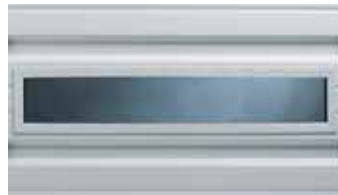
24" X 4" PLEXIGLAS®

*Note: Both options available with either a black or white frame.