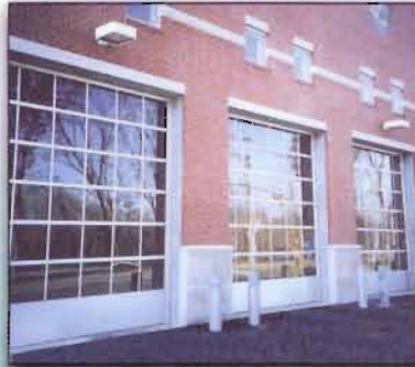
Milford Fire Dept., Milford, MA