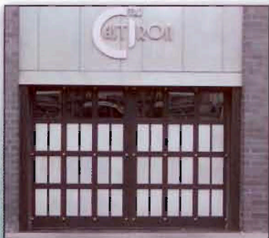
Parking Garage Installed by Advanced Door Sales, Franklin, NJ