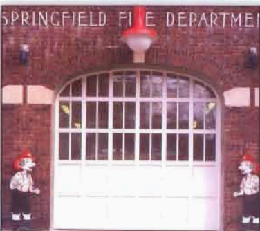
Springfield Fire Dept., Springfield, NJ