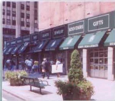
International Pavilion, 5th Ave., NY, NY