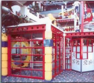
Mall of America, Bloomington, MN