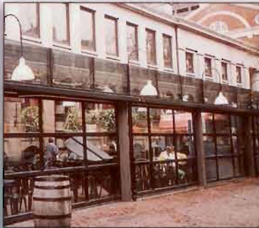
Quincy Marketplace at Faneuil Hall, Boston, MA