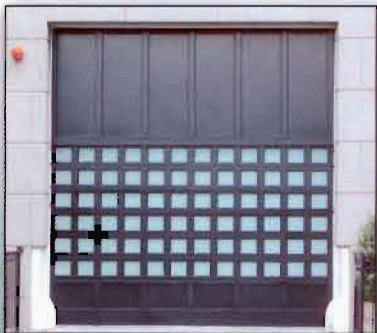
Private Residence Installed by Advanced Door Sales, Franklin, NJ