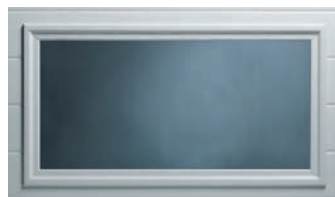
24" X 12" SSB OR INSULATED GLASS