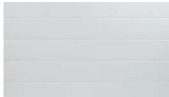
RIBBED PANEL WITH STUCCO EMBOSMENT