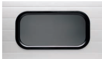
26" x 13" DOUBLE INSULATED ACRYLIC WINDOWS WITH BLACK FRAME WHITE FRAME AVAILABLE (SPECIAL ORDER)