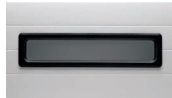
24" x 6" DOUBLE INSULATED ACRYLIC WINDOWS WITH BLACK FRAME WHITE FRAME AVAILABLE (SPECIAL ORDER)