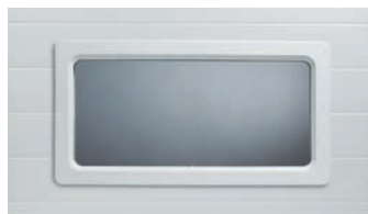
24" X 12" INSULATED GLASS