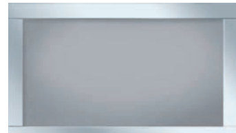
OPTIONAL FULL-VIEW PANEL