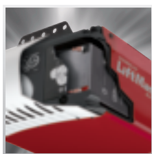
12V DC battery fits neatly inside the opener

The EverCharge™ Battery Backup System will operate the garage door opener for 40 cycles within a 24-hour period and recharges automatically when the power comes back on.